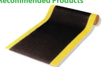
Battery Room Aisle Mat